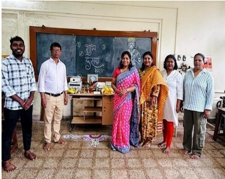
Photo and caption Details will be provided by Electronics Department.