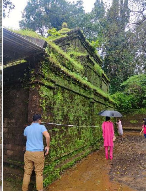
Measured Drawing of Saptakoteshwar temple at Khandepar by 2 nd year students, Diploma in Architectural Assistantship on 14 th August 2025. supported by Directorate of Archeology, Mala, Panaji, Goa